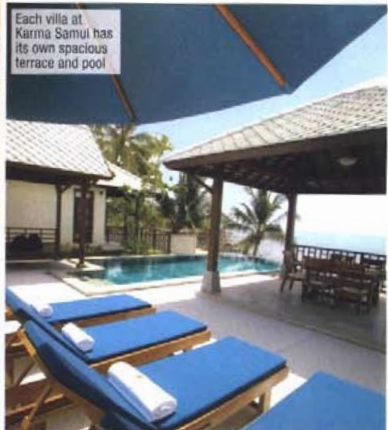
Each villa at Karma Samui has its own spacious terrace and pool