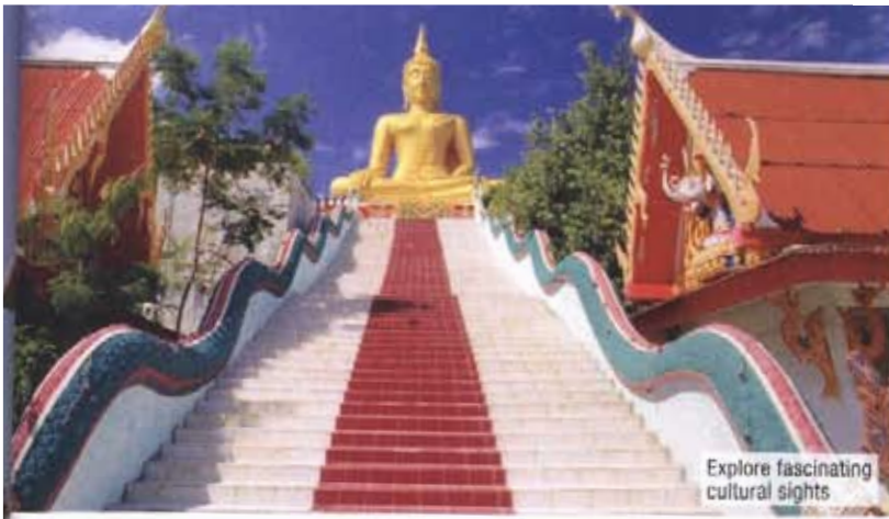
Explore fascinating cultural sights