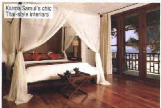
Karma Samui's chic Thai-style interiors