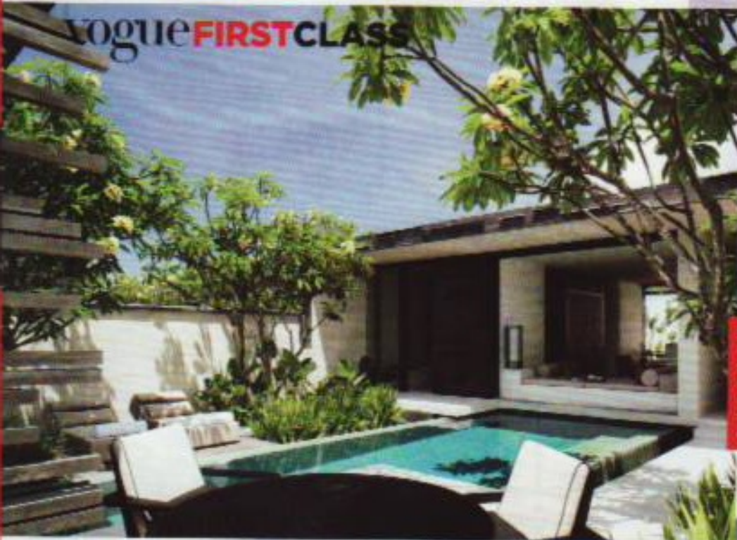
From left: an ultra-stylish Alila poolside villa with cabana; guests may choose to dine at the cliff-edge cabana overlooking the sea.