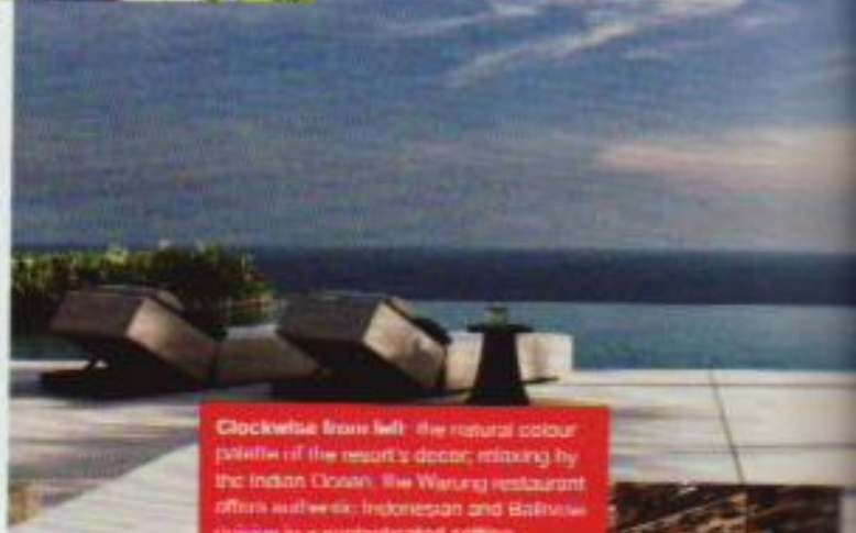
Clockwise from left: the natural colour palette of the resort's decor; mixing by the Indian Ocean; the Waring restaurant offers authentic Indonesian and Balinese cuisine in a sophisticated setting.

A s every Australian traveller knows, Bali is not short of adequate hotels, good hotels or even great hotels, but Alila Villas Uluwatu has set a whole new benchmark when it comes to a luxury stay. There are certain standards that the discerning guest has now come to expect from an upmarket Balinese resort: a private plunge pool in your villa, a luxury spa, fine dining options, a personal butler. Alila delivers on all these de rigueur requirements, at the same time ramping them up a notch to the next level of luxury. It's as if Alila has seen the future of world-class resorts, and introduced it now.